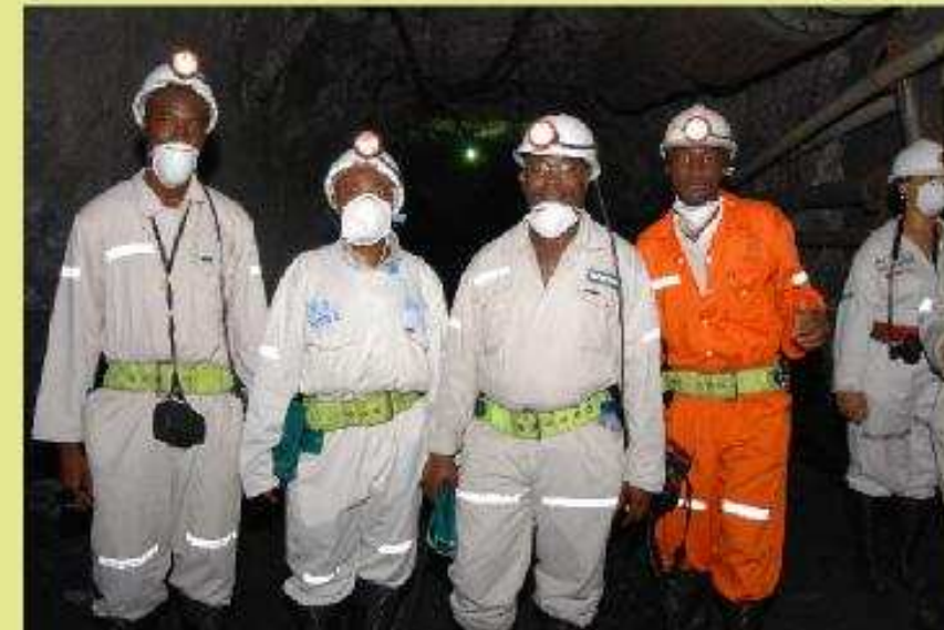
GHEITI Secretariat tour underground