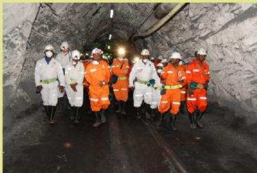
A walk through the tunnel

With so much anxiety and fear and not knowing what to expect down there, we took a swift dive 1,500 meters down the Anglogold Ashanti-Obuasi mine. The underground mine is a whole world on its own with a network of tunnels. Whilst my basic geography had psyched me up for a humid and rather warm environment, for a moment we forgot about our surroundings. The underground had good illumination, cool temperatures and appropriate humidity helped among others by the continuous refrigeration of the underground.