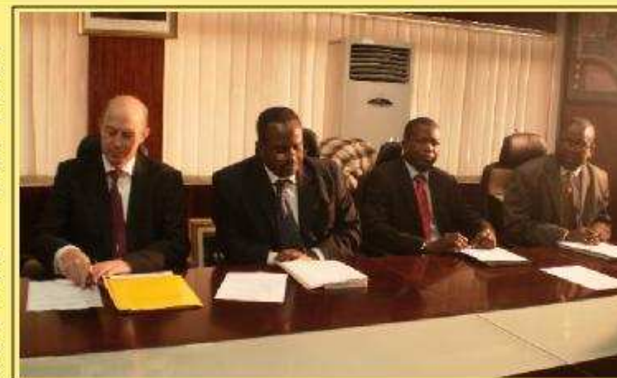
Some members of the National Steering Committee

Finally, he congratulated the nominees for accepting to take up this challenge. He entreated them to actively play an effective role in the Committee and ensure that proper channels of communication exist to effectively disseminate the outcome of all meetings.