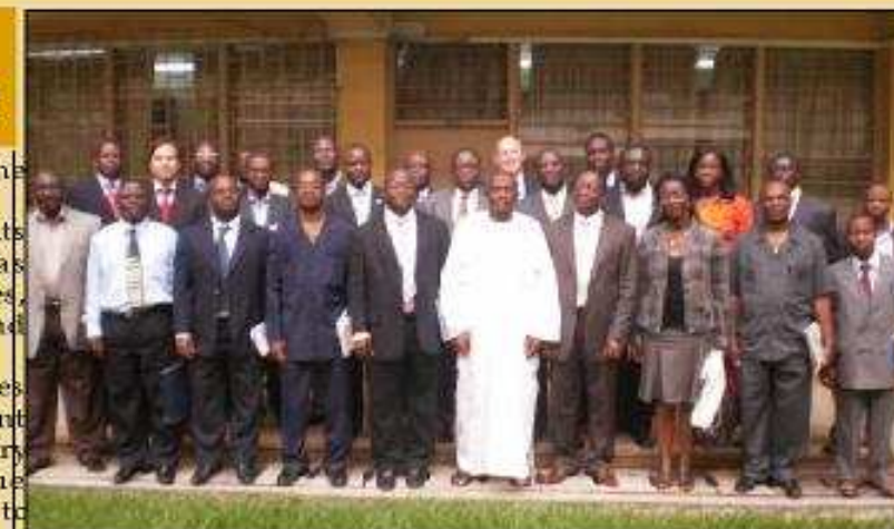
Group picture of members of GHEITI with some sector ministers