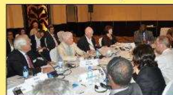
Board members of EITI at a meeting in Dar-es-Salaam, Tanzania.

and reporting practices. Mongolia and Ghana became the fourth and fifth countries to achieve EITI Compliance, joining Azerbaijan, Liberia and Timor-Leste.