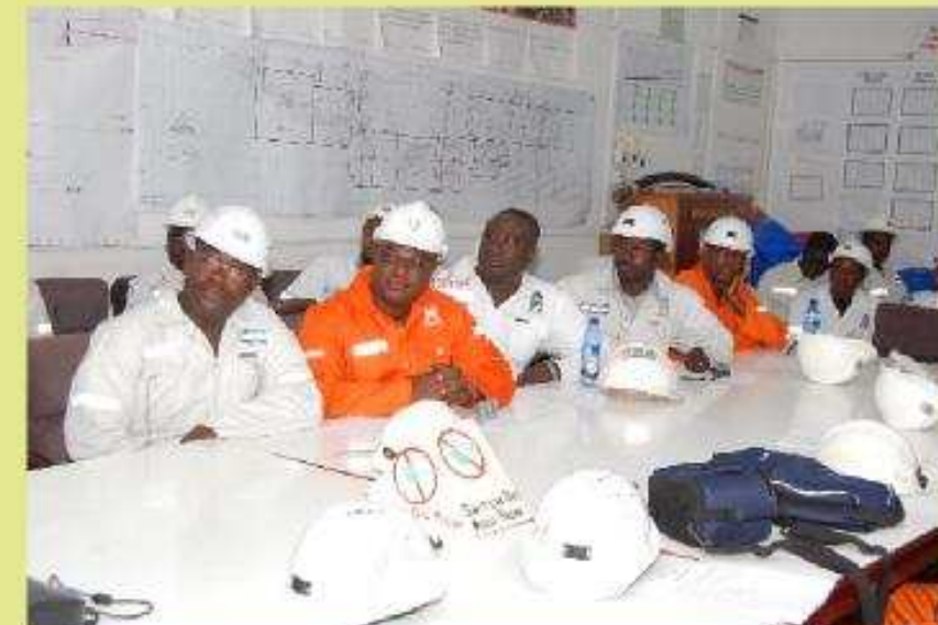
A short briefing before the underground tour