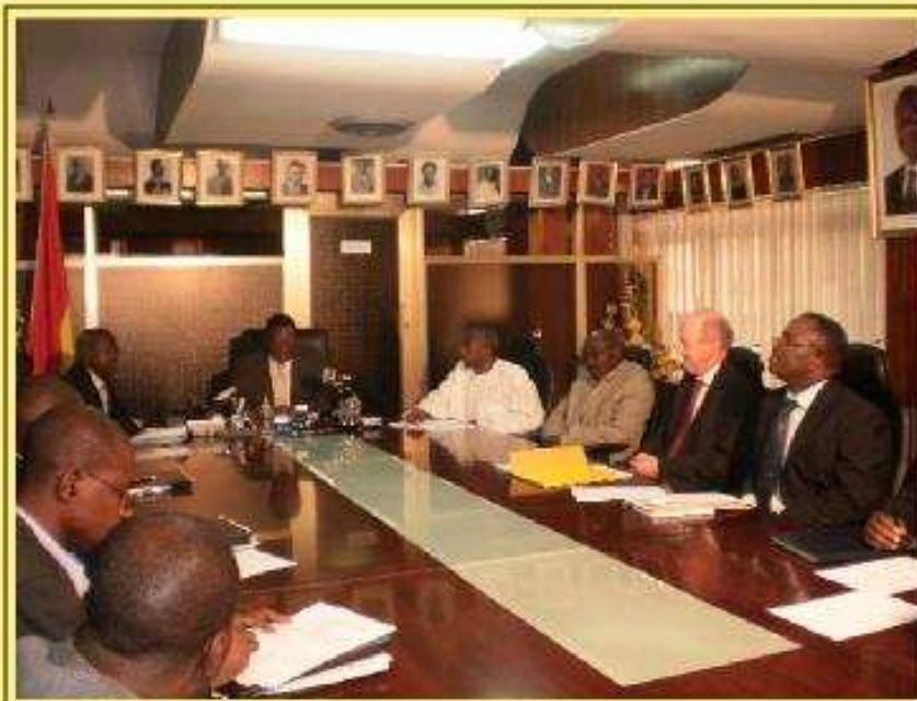
Cross section of members of the National Steering Committee

The inauguration ceremony which took place on 8th September, 2010 was attended by the Hon Minister of Lands and Natural Resources and the Hon. Deputy Minister of Energy and the Hon. Minister of Environment, Science and Technology and members of the new GHEITI Steering Committee. (See back page for full list of members).