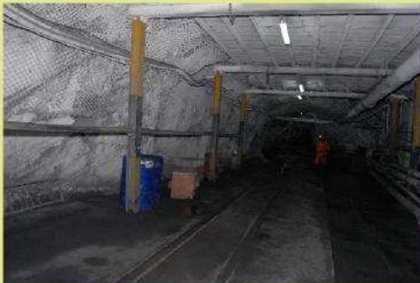
Tunnel - 1,500 meters underground

The miner, a man with heart good and kind Sat by the side of his son He said "It's my living, I can't stay away, For duty my lad must be done".