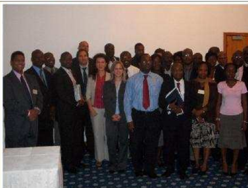
Group photograph of participants at the I.T. solutions workshop.

Subsequently, a two-day stakeholder workshop was