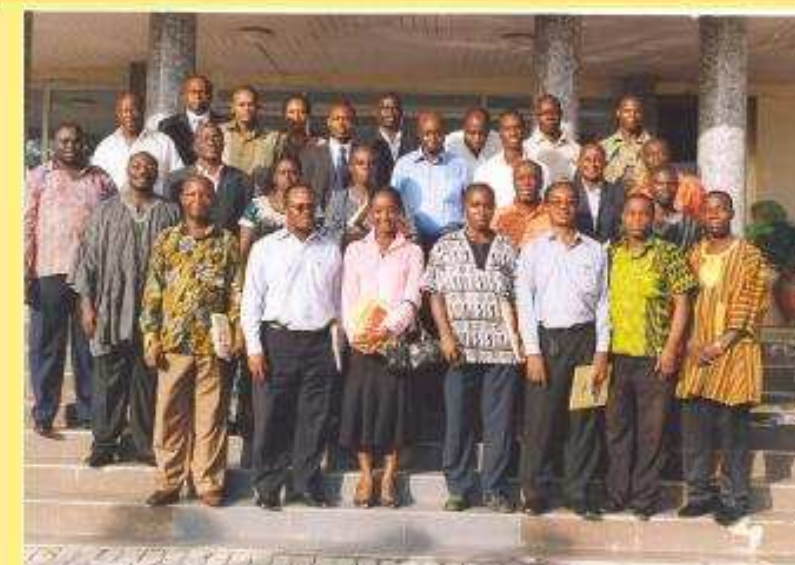
Group photograph of participants

The first in the series was held on 18-19 June, 2010. The workshop was on the extension of the EITI to Oil and Gas sector. The workshop was also in line with the GHEITI work plan approved by Cabinet to sensitize stakeholders on the activities of EITI in Ghana. The objective of the workshop is to inform stakeholders of plans by the Ghana EITI to extend its principles to the oil and gas sector. The workshop which was organized at the Akroma Plaza Hotel-Takoradi was well attended by the District/Municipal Chief Executives, Presiding members, Finance officers and Traditional